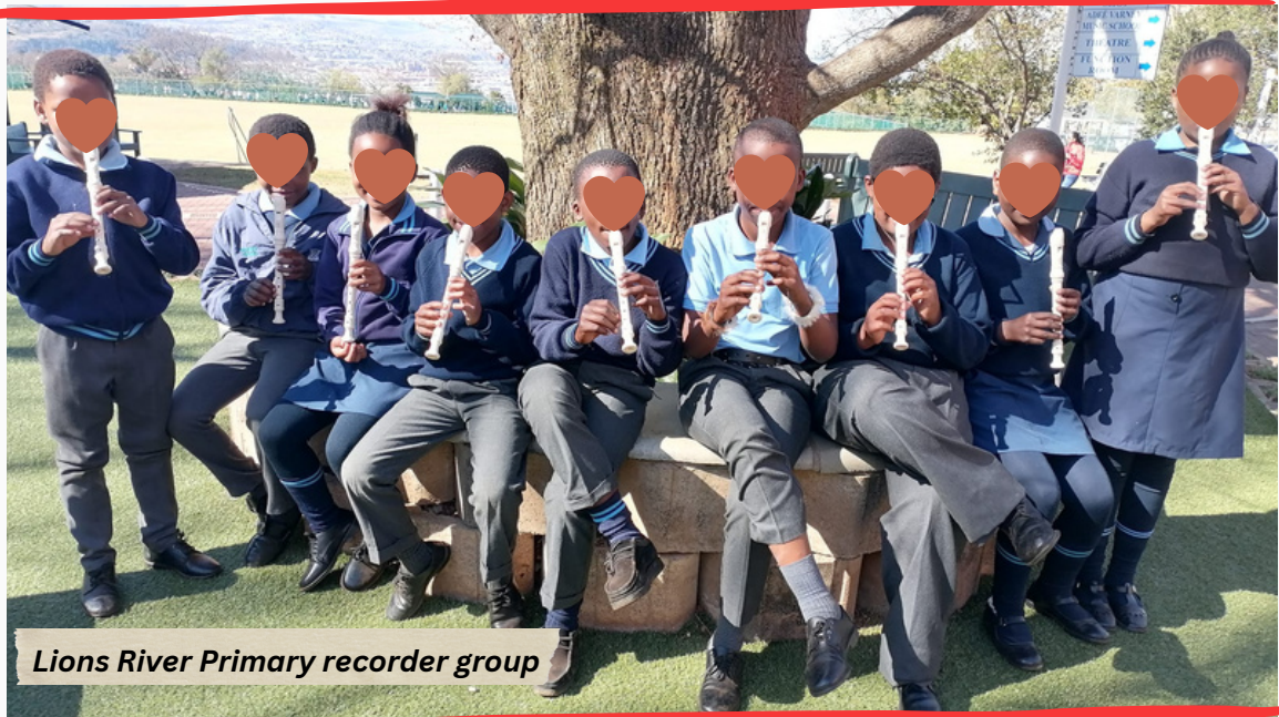
Lions River Primary recorder group